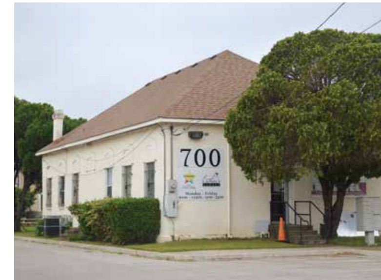
Cen-Tex African American Chamber of Commerce

The mission of the Waco NAACP, like that of the National NAACP, is to ensure the political, educational, social, and economic equality of rights of all persons and to eliminate race-based discrimination. Since its founding in 1936, the Waco NAACP has worked to secure the social and political equality of all citizens of McLennan County. Meetings are held every fourth Monday of the month at the Waco Central Library.