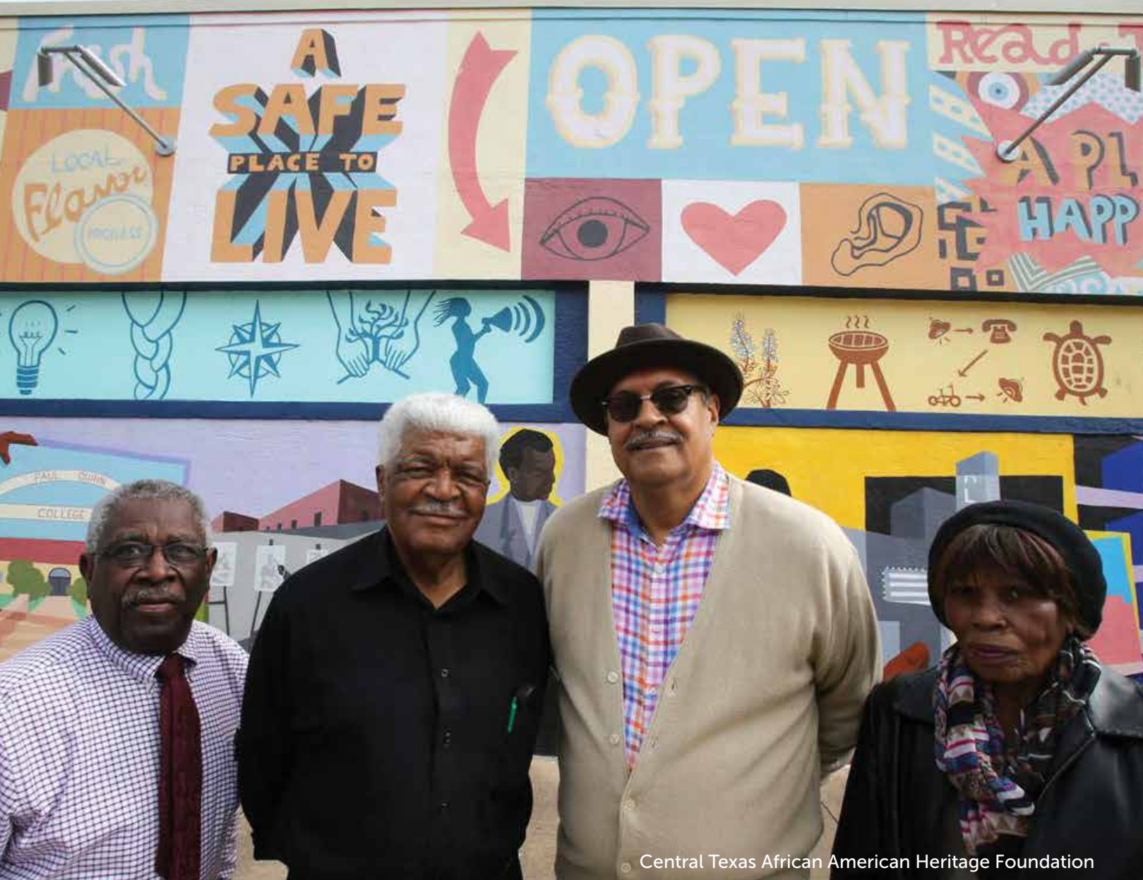
Central Texas African American Heritage Foundation