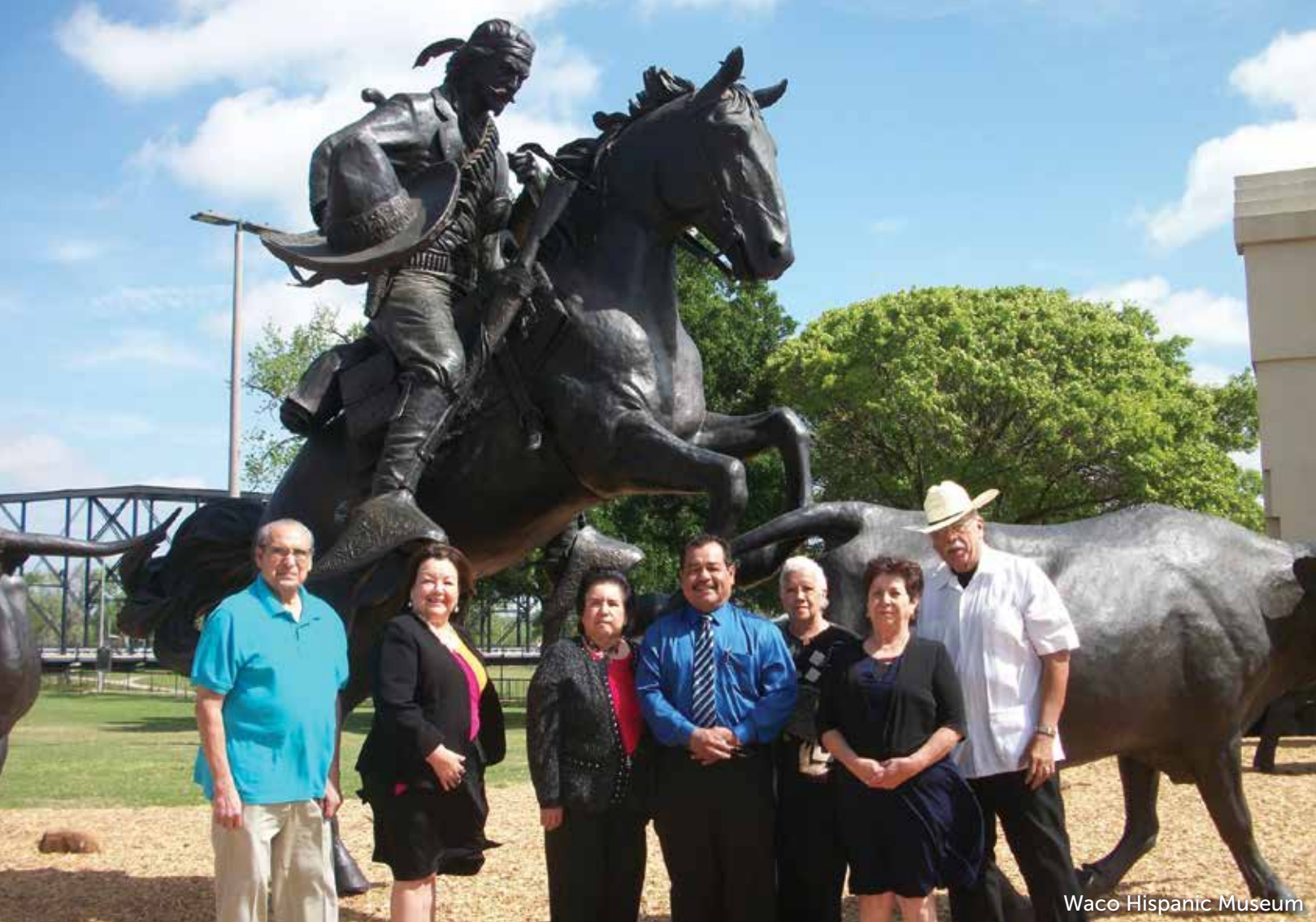
Waco Hispanic Museum