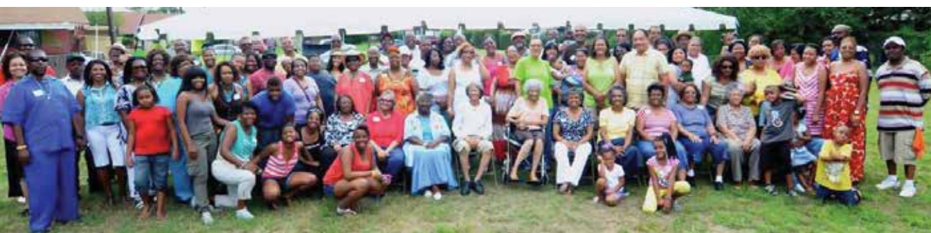
Gholson Heights/Sharondale Neighborhood Reunion

Visit wacohistory.org for more African American cultural landmarks within Waco.